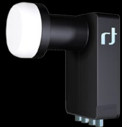
Quad HGLN 40mm IDLB-QUDL40-ULTRA-OPP