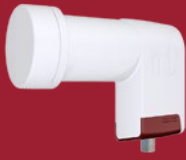
Single Long Neck 40mm IDLR-SINL42-EXTND-OPP

The long neck allows greater flexibility in positioning the LNBs next to each other enabling access to satellites typically too close in their orbital position to be received with standard neck LNBs. Manufactured to the highest industry quality standards and designed to meet strict specifications, this LNB is an ideal solution for the satellite broadcast reception across Europe.