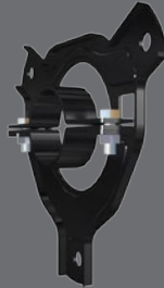
Ku feed horn for prime focus antennas IDLB-FKU40-BRCKT-OPP