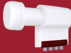
Quad Long Neck 40mm IDLR-QUDL40-EXTND-OPP