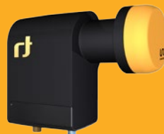
Unicable Quad 40mm LNB 2 Legacy IDLB-QUDL42-UNI2L-OPP