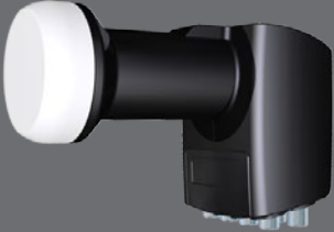
8 Output 40mm IDLB-OCTL40-O0000-OPP

All Pro™ LNBs are excellent for the reception of HDTV broadcasts and will exhibit excellent noise figure values.