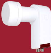
Twin Long Neck 40mm IDLR-TWNL40-EXTND-OPP