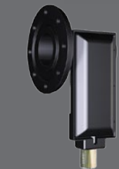
Single Flange IDLB-SINFO1-OOPRO-OPP