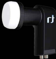
Twin HGLN 40mm IDLB-TWNL40-ULTRA-OPP