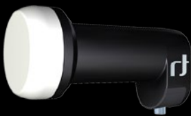
Single HGLN 40mm IDLB-SINL40-ULTRA-OPP

The BLACK Ultra™ is a high performance LNB range featuring the lowest noise figure available to address the need for superior reception at the edges of the satellite footprint skirt or difficult installation setups with long RF cable and/or a small dish size. Thanks to its novel front-end architecture and superior components, this LNB range provides higher conversion gain yet maintained with the lowest noise figure and best phase noise performance. The combination of higher grade components, excellent isolation and advanced filter design enables improved handling of interfering spurious and provides the leap in the overall reception performance compared with standard LNBs. This range includes 40mm L-Shape Single, Twin, Quattro and Quad models.