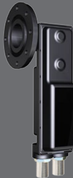
Twin Flange IDLB-TWNFO1-OOPRO-OPP