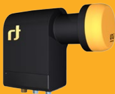
Unicable Quad 40mm LNB 1 Legacy IDLB-QUDL42-UNI1L-OPP

Enabling the connection of up to four receivers or two receivers and one dual-tuner PVR, over a single cable, the Unicable™ LNB models support different connection possibilities - use the LNB's legacy ports to connect up to two receivers that do not support the Single Cable Distribution standard (EN50494). All Inverto Unicable™ LNBs are 100% HDTV compatible.